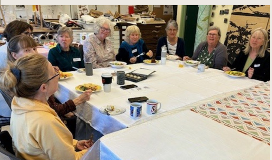
Lunch time at the Print Café!

PS – check out their website at https://printmakersofthesalishsea.com/