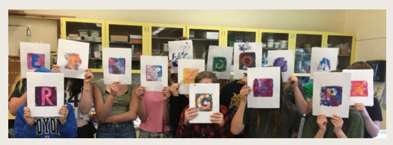
Grade 6 Salt Spring Elementary, gelli plate

Please note that when classes are in the studio it is closed to other activities. Please check the website calendar!